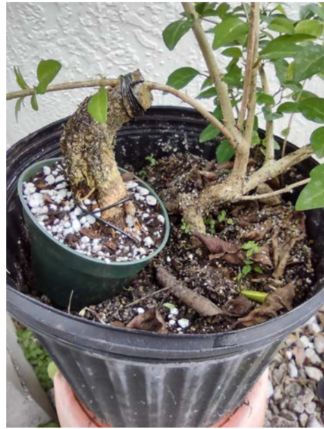
Top left -original tree prior to demonstration. Top right & bottom left -views of graft. Bottom right original tree styling and repotted